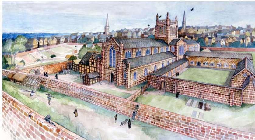
The church played an important part in the life of Chester’s community in the Middle Ages. This reconstruction painting shows the Dominican Friary, on the western side of the city, one of Chester’s six medieval religious houses, as it might have appeared in the fifteenth century. The Dominicans were the first friars to establish themselves at Chester, founding their house c 1236.

Information technology will be playing a large part in the project: for example, a geographical information system will be used and developed in order to create a multi-layered interactive digital map of Chester as it was in c 1500.