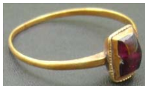
A late medieval gold ring with a garnet setting, found in Chester in 2007

Life in a late medieval city Chester 1275–1520 by Jane Laughton. 264pp, b/w & colour illus. Published by Windgather Press, an imprint of Oxbow Books 2008. Paperback £20, available from the Grosvenor Museum shop.