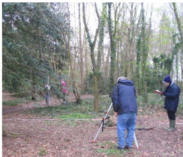
Surveying the woodland